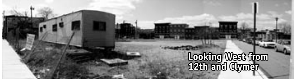
Looking West from 12th and Clymer