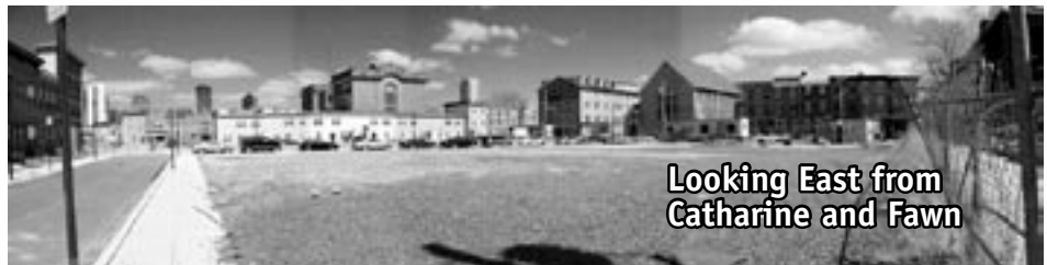
Looking East from Catharine and Fawn