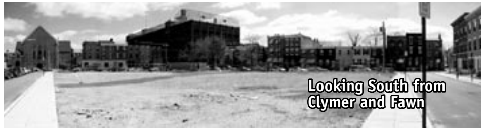
Looking South from Clymer and Fawn